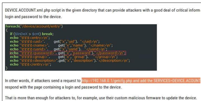
Fig. 6. Snippet from 12-Sep-2017 advisory for D-Link DIR8xx Multiple Vulnerabilities [24].

It is interesting to notice the same /getcfg.php in both these advisories. Also, note the <password>*</password> tags in Figure 6, which resembles a lot the previously presented exploits from 2008 and 2013. Also, the advisory title "Enlarge your botnet with: top D-Link routers" from [24] suggests that some recent IoT malware botnets have been or might be abusing it already. Finally and again, both these advisories do not have or provide a CVE number for the vulnerability related to exploitation of /getcfg.php and <password>*</password> tags.